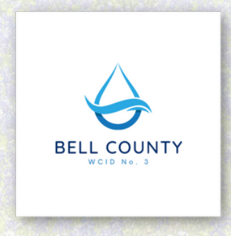
Water Department Updates