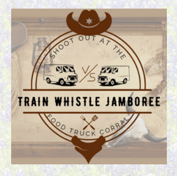
Food Truck Contest