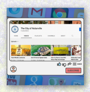
Follow Us On Youtube